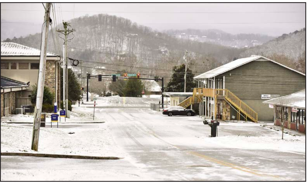
Towns County was fortunate to have been spared a major snow event, though plenty of side roads were slick enough to keep many people home Monday morning.

great job, but the biggest thing is, we were very fortunate that Towns County Schools announced Monday that, due to inclement weather, students in the system would be hav-Out of an abundance of ing an online learning day for