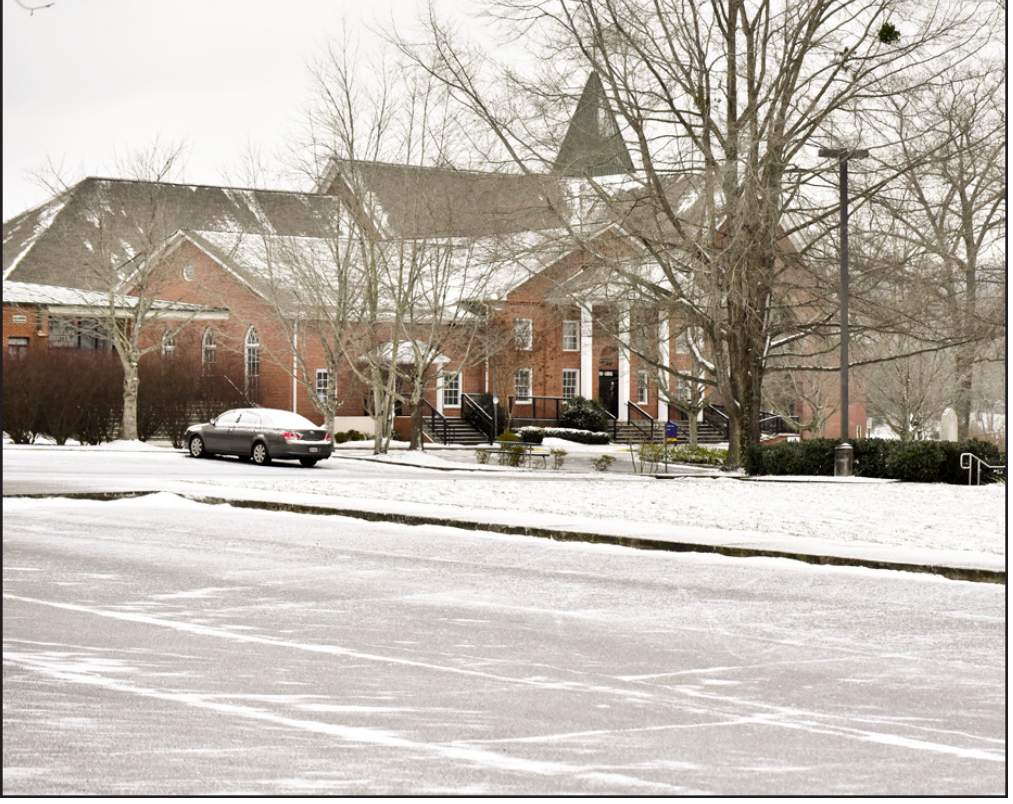
McConnell Memorial Baptist Church in the snow Monday morning.