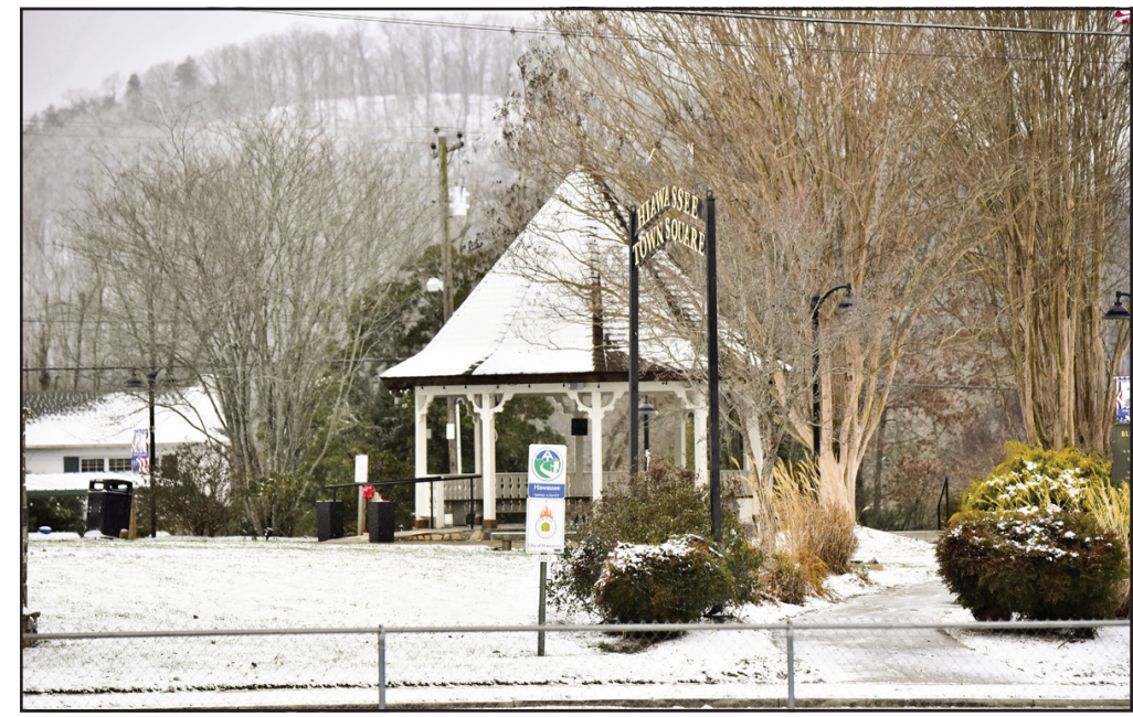
The Hiawassee Town Square got about as much snow as the rest of the county over the weekend, about inch or so with isolated areas of higher snow totals.