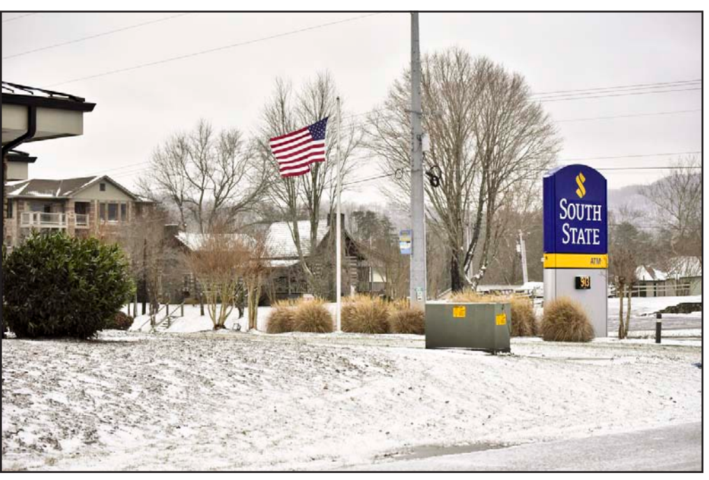
Like many places, SouthState Bank was closed in observance of Martin Luther King Jr. Day, though the weather may have been enough to have resulted in closure anyway.