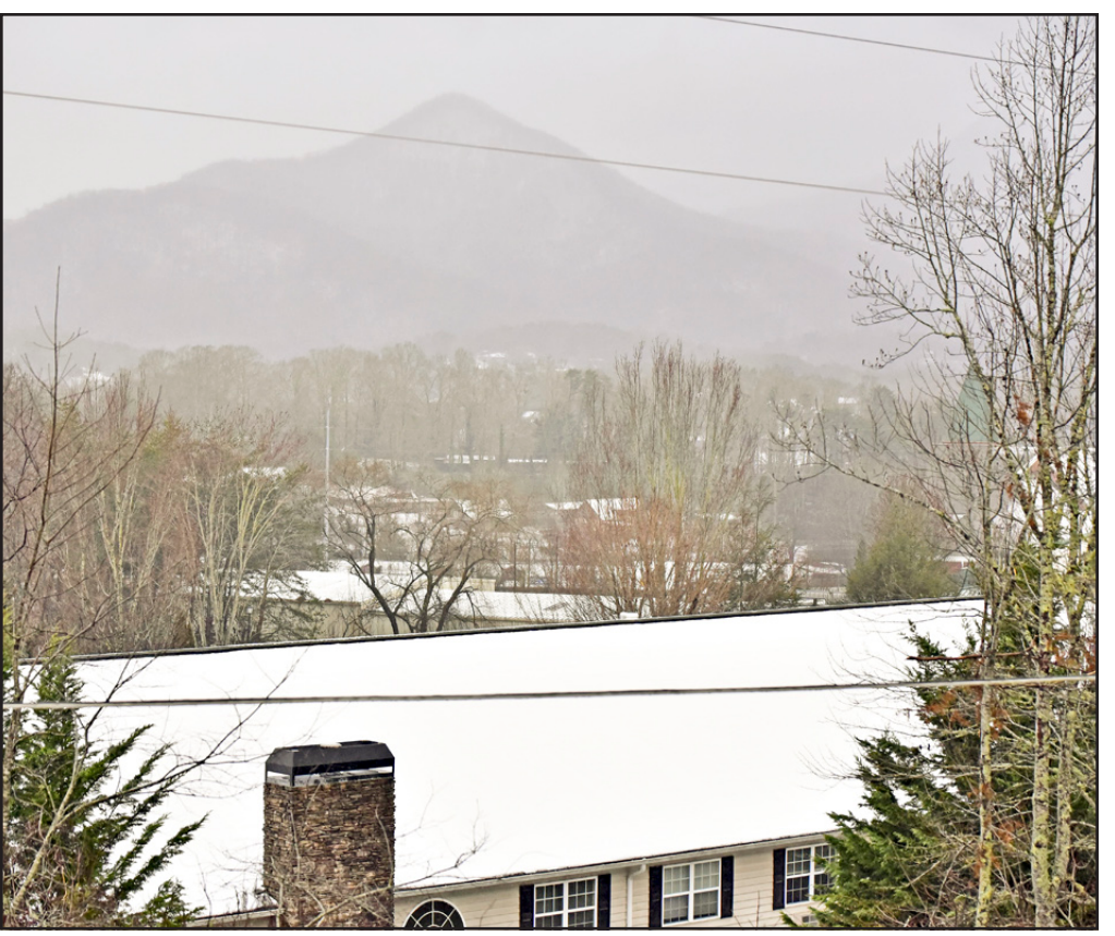
A view of Hiawassee from above Brasstown Manor Sunday morning.